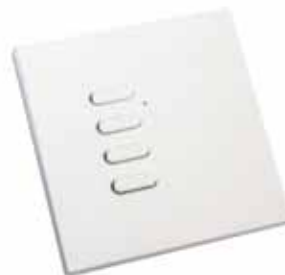
WIRELESS DIMMER REMOTE