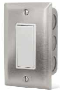
HARD WIRED REMOTE

*As per manufacturer's published data at time of print